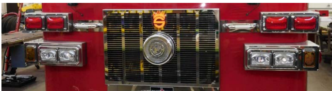
12710100 SIREN, FEDERAL Q2B, GRILLE MOUNT

With the recent update to the configurator. The Sales Department would like to clarify the mounting locations for the Q2B. The previous grille mount option will no longer refer to a "flush" mount, the previous option for "recessed in bumper" will read "front bumper mount", and there is a new option for a "flush bumper mount". The options are depicted below for future reference.