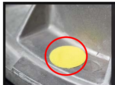
JW Speaker 8800 Evolution 1 (past)

If you have any questions regarding this Sales Technical Bulletin please contact your Sales Territory Manager for more information.