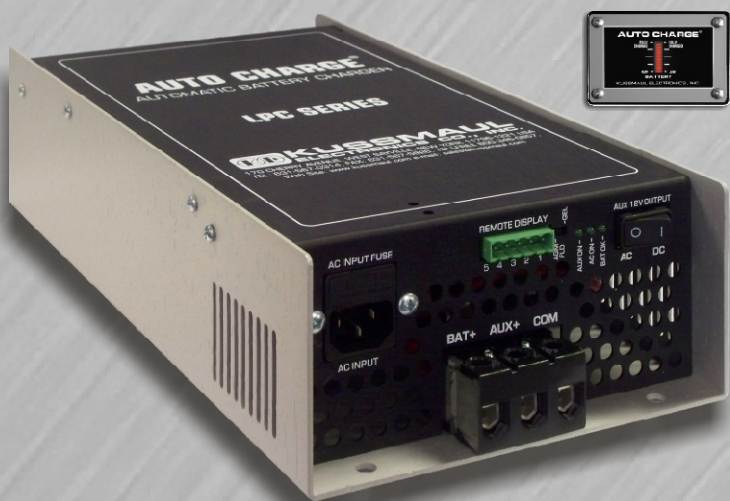
MODEL # 091-200-12

The Auto Charge 40 LPC is a fully automatic battery charger designed in a compact rugged package that saves valuable compartment or under seat space in fire apparatus and other emergency vehicles. The LPC series smart chargers, provide rapid replenishment of batteries, with a clean, no electronic interference output. May be used for positive and negative ground systems. Front panel connections allow easy wiring of AC Power, Batteries, Remote Indicator, and Auxiliary Loads, such as hand lights, radios, and Auto Pumps. Charger is available as a float charger or a 3 Step mode charger. Use Model Number 091-200-12-3S when ordering 3 Step mode charger.