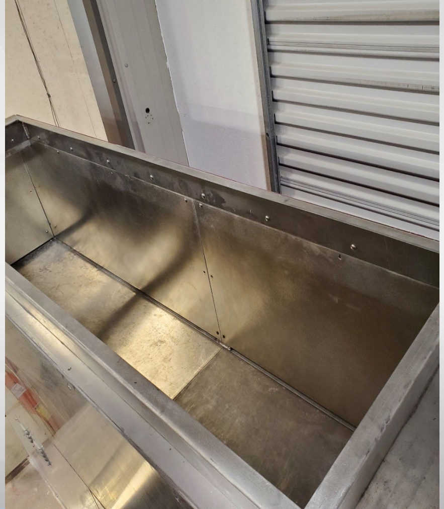
Coffin Wire Protection