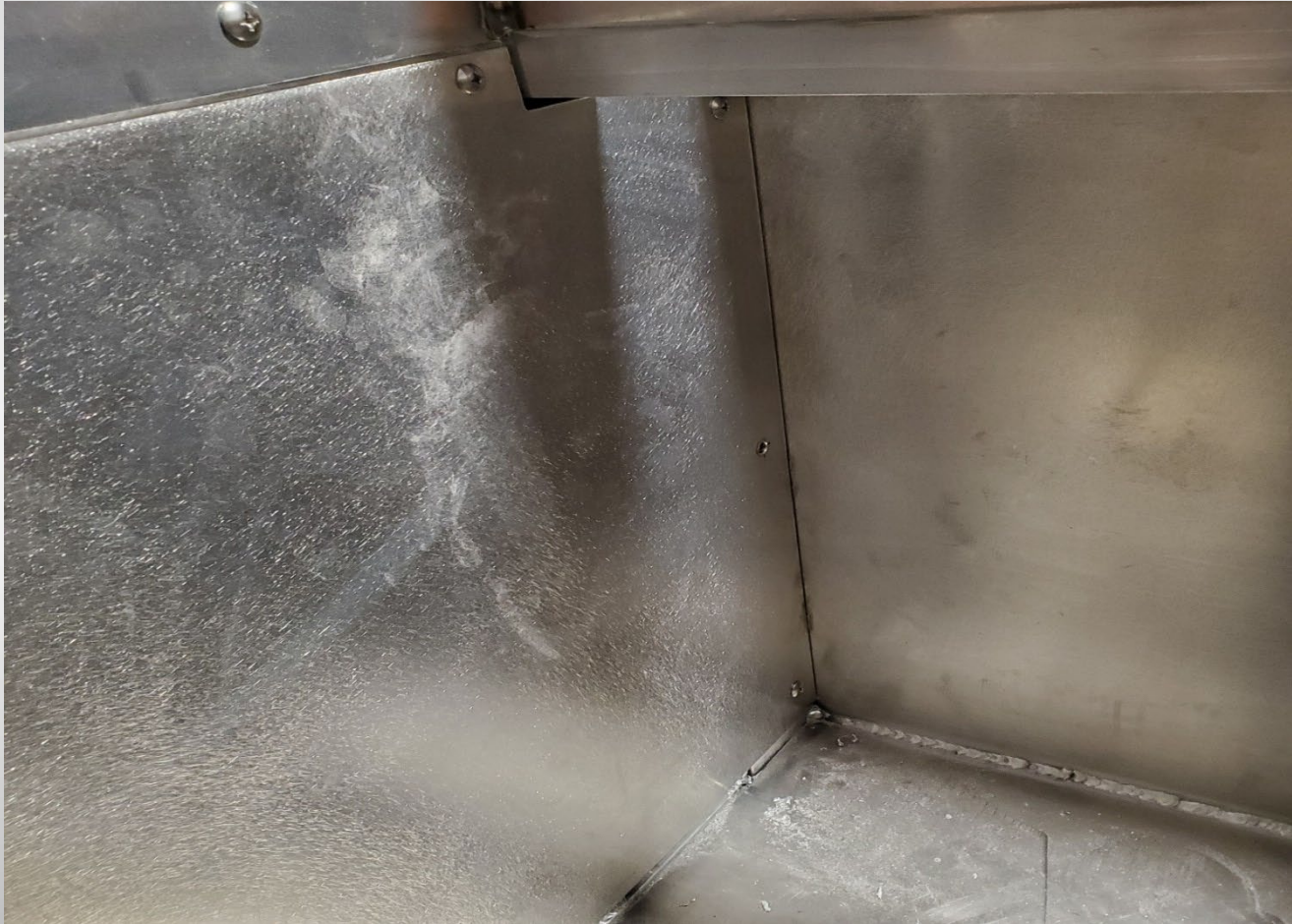
Coffin Wire Protection