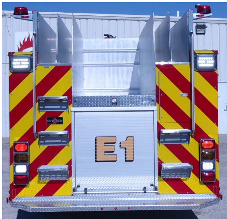
Drop Center Hosebed Up to a 1000 gallon water tank.