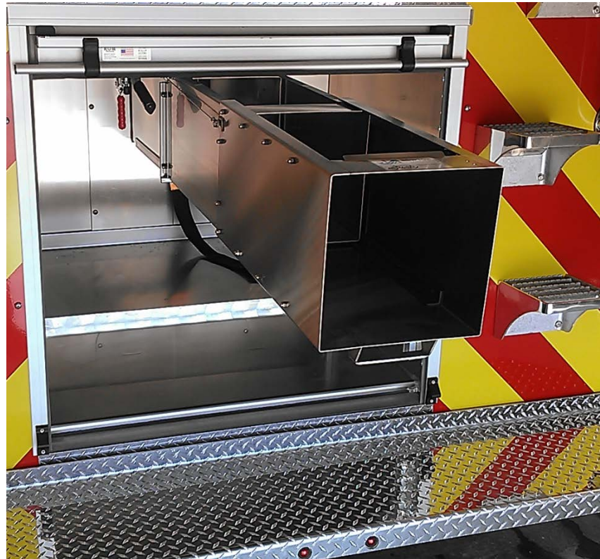
Dump Chutes Square or round, manual or electric