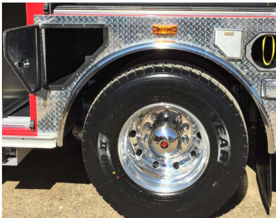
Triple Air Bottle Compartment Available with or without divider.