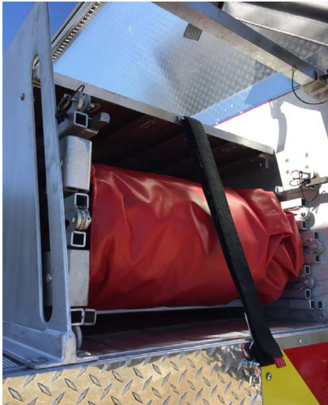
Folding Tank Storage in Hosebed Up to a 3000 gallon double folding tank